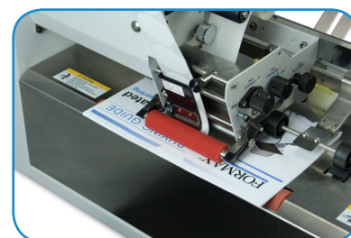
Applicator and rollers ensure tab is tightly folded and sealed