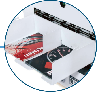
Adjustable Catch Tray Keeps cut cards neatly stacked, adjusts for different sizes