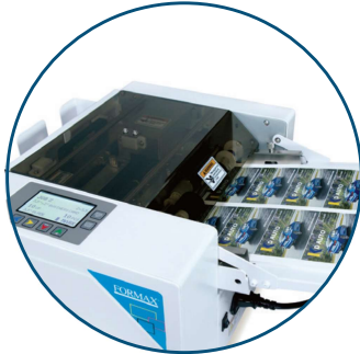
Double Friction Feed System Automatic feeding throughout job runs with interlocking plexi cover for safety

The FlashCard Business Card Cutter processes up to 144 business cards per minute . Featuring an intuitive LCD display , it's easy for operators to use one of 5 pre-programmed jobs or set up to 11 custom jobs . The infeed tray holds up to 40 sheets and can accommodate paper weights up to 350gsm. The FlashCard easily handles coated and uncoated paper, laminated sheets, and card stock. A standard 3.5" cutting cassette can be used to produce 2" x 3.5" business cards. Optional interchangeable cutting cassettes are available to produce various sizes including 5" x 7" cards, 4.25" x 8" postcards, 3.5" x 10" menu cards, and more. User-friendly features and a small footprint make this the ideal on-demand low-volume cutter.