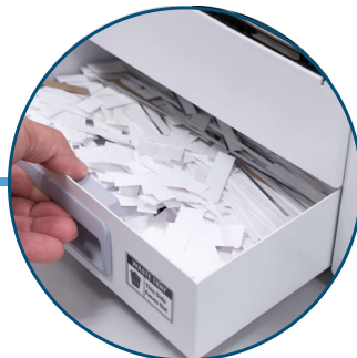
Built-in Waste Bin Collects paper scraps and is easy to access and empty