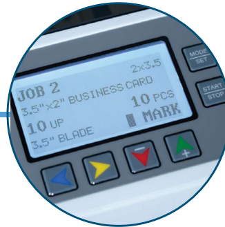
User-friendly LCD Control Panel Intuitive display allows users to select from programmed or custom jobs