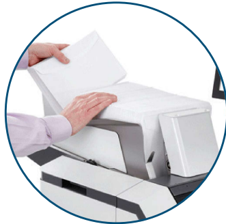
High-Capacity Envelope Feeder Holds up to 800 envelopes with on-the-fly reloading for continuous operation