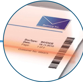
Optional Full-Page Scanner Reads a variety of codes, printed in any location, on both sides on the page