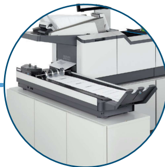
High-Capacity Output Conveyor Holds up to 500 filled envelopes, can be used straight-on or at 90°