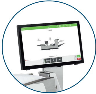
22" Intuitive Color Touchscreen Graphical interface provides quick and easy setup

The 7104 Series is available in 3 configurations, with an optional Productivity Package . Its modular design offers up to eight modules with up to 17 feed stations , high-capacity feeders , and a standard capacity of up to 1,500 sheets . Feeder combinations include: one 1,000-sheet feeder, one 500-sheet and one 1,000-sheet feeder, or three 500-sheet feeders. The 7104 Series processes up to 4,500* envelopes per hour and folds up to 8 sheets at a time . Standard features include a 22" color touchscreen , unlimited programmable jobs , an accumulator/divert deck , custom cabinets on casters , and a high-capacity envelope feeder , and 4-foot output conveyor . A variety of intelligence features, modules, and output options are also available, in addition to the Productivity Package.