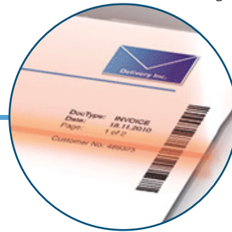
Full-Page CIS Scanner* Reads OMR, 1D, and 2D BCR codes printed horizontally or vertically