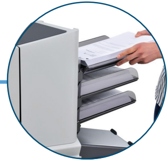
Easy-Load Document Feeders Various configurations from high capacity to short feed trays