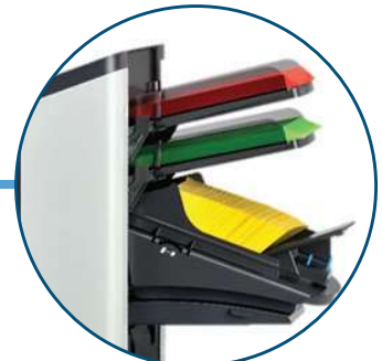
Optional Production Feeder Holds up to 325 BREs or 1,200 inserts up to 6" long