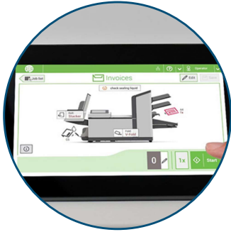
Graphics-Based Color Touchscreen Quick and easy job setup, with paper and envelope presence sensors

Four configurations are available: FD 6210-Basic 1 (one automatic sheet feeder), FD 6210-Basic 2 (two automatic sheet feeders), FD 6210-Advanced 2 (two sheet feeders and one insert/BRE feeder), and FD 6210-Special 2 (two sheets feeders and a special insert/BRE feeder). Standard features include a 7" full-color touchscreen , high-capacity vertical output stacker , automatic paper/envelope presence sensors , a top-loading envelope hopper , ECO Mode , and AutoSet™ one-touch setup. Recurring jobs run in AutoSet™ can also be stored as one of 50 programmable jobs . Options include a Productivity Package , a CIS full-width scanner , short feed trays , production feeder , side exit trays , and code reading licenses .