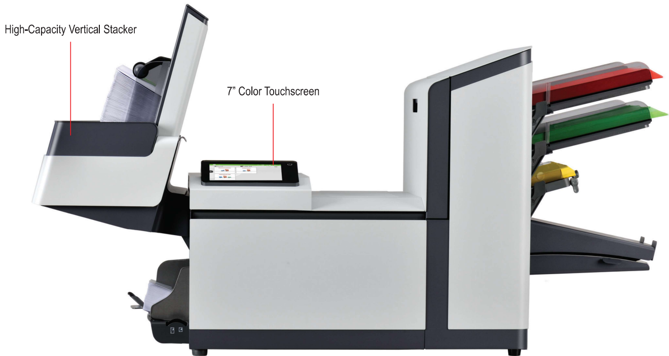
FD 6210-Advanced 2