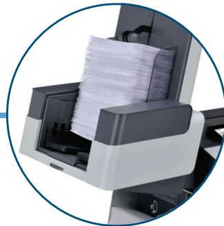
High-Capacity Vertical Stacker Output stacker holds up to 500 filled envelopes