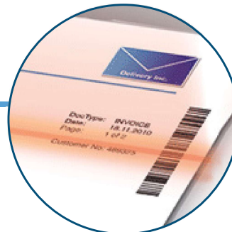
Optional Full-Page CIS Scanner Reads OMR, 1D, and 2D BCR codes printed horizontally or vertically