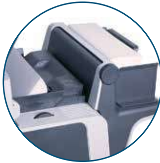
Dedicated BRE/Insert Feeder Fold and/or insert BREs or small inserts