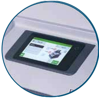
Intuitive Color Touchscreen Graphical interface for quick and easy setup with job list on the home screen

The FD 6104 Low-Volume Inserter features a full-color touchscreen control panel and wizard-based software to guide operators through setup and operation. It provides quick access to saved jobs, right on the home screen, while bold icons indicate the status of each feeder. Users can program up to 15 jobs for instant, one-touch operation. Standard features include 2 fully-automatic sheet feeders , 1 automatic insert/BRE feeder , double document detection , cascade mode , and ECO mode . It processes documents up to 14" in length , producing up to filled 1,350 envelopes per hour . With a small footprint, and affordable price point, it's ideal for any size organization to enjoy the benefits of automated folding and inserting.