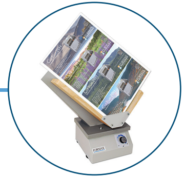
Handles Larger Sheet Sizes Easily jogs sheets up to 11" x 17", in large or small stacks