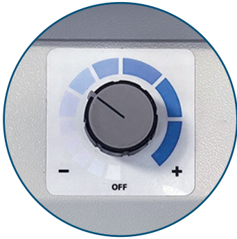
Solid State Control Knob Controls power on/off, and vibration speed up to 4,000 vpm

The FD 402P1 Single-Bin Paper Jogger provides quick and easy alignment for a variety of paper sizes up to 11" x 17". Jogging helps to separate forms and sheets and reduce static electricity commonly caused by laser printers. The result is more accurate feeding through pressure sealers, folders, inserters and other paper handling equipment. Its solid state switch controls on/off and vibration speeds , up to 4,000 per minute, while the tilted rack helps to properly jog small paper stacks. Electromagnetic design allows for continuous operation , while the slotted design allows paper dust, staples, paper clips to exit the jogging bin for simple clean-up and maintenance.