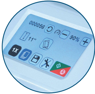
Color Touchscreen Control Panel Utilizes easily-recognized symbols in place of text

The Automatic FD 386 Document Folder folds up to 17,000 pieces per hour! Fully automated fold plates provide one touch set-up of the 18 pre-programmed or 27 custom folds that can be stored into memory. The FD 386 folds up to 500 sheets in as fast as 2 minutes and holds the folded pieces on its patented Telescoping Conveyor System with adjustable stacker wheels . The large full-color touchscreen control panel allows operators to walk up and start folding with little to no instruction. The optional patented Multi-Sheet Feeder allows up to 4 stapled or unstapled sheets to be folded at one time. The FD 386 can also be combined with the optional V-Stack36i Vertical Stacker , which stacks up to 22" of folded documents.