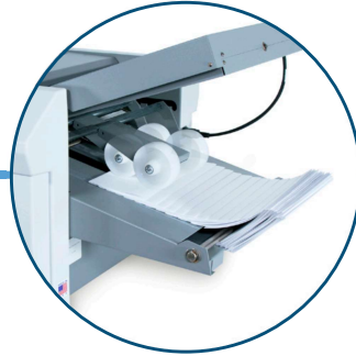
Adjustable Stacker Wheels Neatly stack different paper sizes and fold types