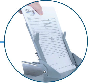
Optional Multi-Sheet Feeder Up to 4 stapled or unstapled sheets can be folded at once