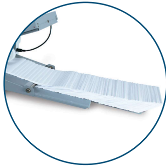
Telescoping Conveyor System Extends from 14" to 36" in length and holds up to 500 folded pieces