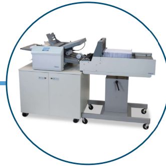
Optional V-Stack36i Vertical Stacker Aligns with outfeed to vertically stack up to 22" of folded documents for further processing