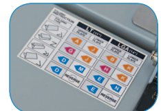
Clearly marked fold guide for quick and easy setup

The FD 300 Office Desktop Folder provides an economical solution for low-volume folding projects. This compact folder processes 11" and 14" paper at speeds up to 7,400 sheets per hour, and is clearly marked for 4 common fold settings.