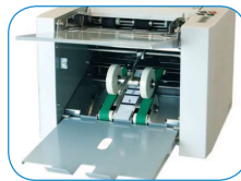
Output conveyor for neat & sequential stacking