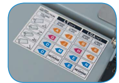
Clearly marked fold guide for quick and easy setup

The FD 300 Office Desktop Folder provides an economical solution for low-volume folding projects. This compact folder processes 11" and 14" paper at speeds up to 7,400 sheets per hour, and is clearly marked for 4 common fold settings.