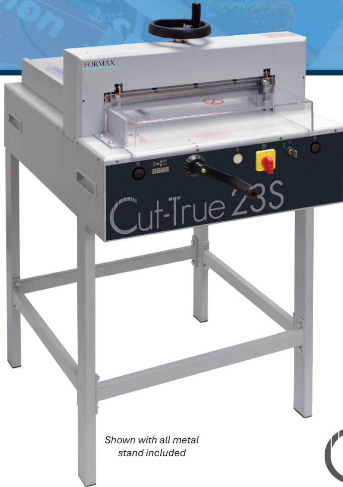
Shown with all metal stand included