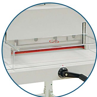
Safety Cover & Back Gauge Crank

Shows exactly where the blade will cut, allowing for precise adjustments