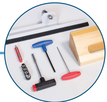
Tool Kit Included

Cleanly cuts paper stacks up to 2.15” high and up to 16.9” wide