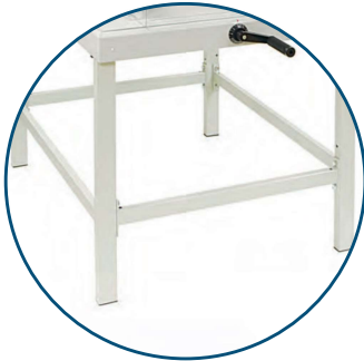
Rugged All-Metal Stand

The Cut-True 115M Manual Paper Cutter combines accuracy with safety and user-friendly features. Using its hardened-steel Guillotine blade and lever-activated blade arm , it has the strength to cut through paper stacks up to 2.15” high and 16.9” wide. The LED Laser Line shows operators exactly where the blade will cut, and the spindle-guided back gauge and calibrated scales allow for precise adjustments. Safety is also a top priority with front and rear plexi covers, blade lock, external blade depth adjustment, blade change safety tool , and a wooden paper push for safe alignment . These features are all housed in a rugged all-metal stand with feet for tabletop use.