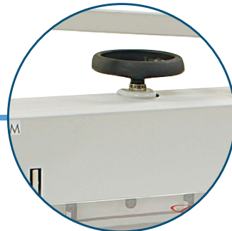
Geared Clamping System

Also includes table top feet so you can cut anywhere