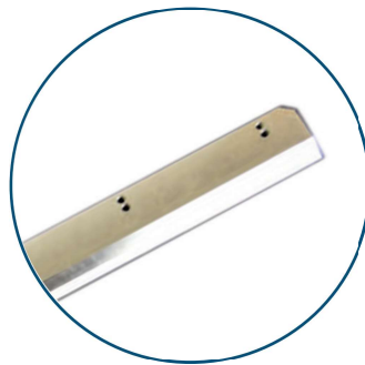
High-Quality Hardened Steel Blade Cleanly cuts paper stacks up to 5/8" high and up to 14.5" wide