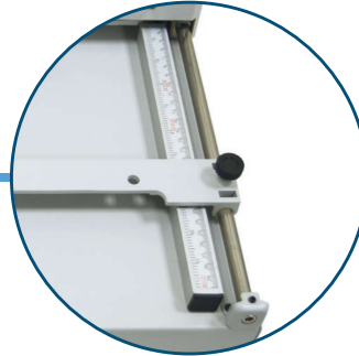
Calibrated Scale Allows for fine adjustments in both inches and metric