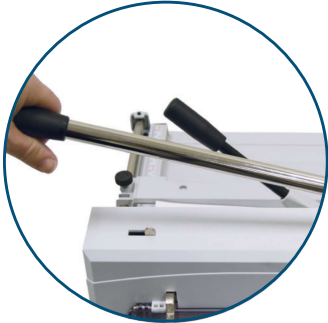
Two-Handed Cutter Arm for Safety Using two hands keeps them away from the cutting blade

The Cut-True 13M Tabletop Paper Cutter is rugged and compact with a hardened steel blade, LED Laser Line for precision cutting with minimal effort, and a variety of safety features. The back gauge and calibrated scales allow operators to make fine adjustments, while the Laser Line shows exactly where the blade will cut, making crisp accurate cuts every time. The Cut-True 13M also includes safety features like front and rear transparent covers, blade lock, external blade depth adjustment, and easy-to-use blade changing handles. It cuts stacks up to 5/8" high and is ideal for small print shops and others who want to produce professional-quality brochures, invitations and more.