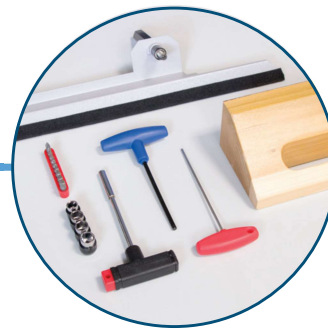
Blade Safety Tool Kit Change blades safely and easily, and make adjustments