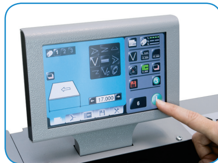
Color touchscreen control panel

* Speed varies depending on paper weight