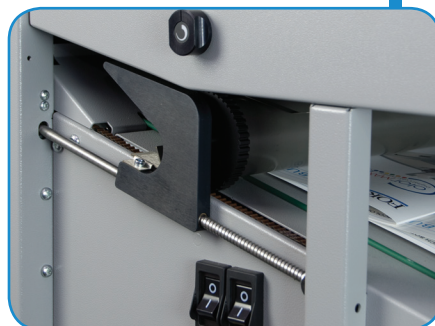
Automatic outfeed rollers