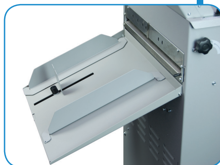
Perforation / score attachment, included

Formax – New Hampshire, USA www.formax.com