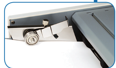
Cross Fold Guide

Formax - New Hampshire, USA www.formax.com