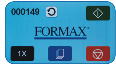
Touchscreen Control Panel