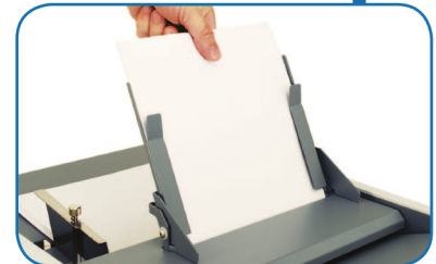
Optional Multi-Sheet Feeder