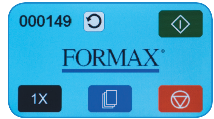
Touchscreen Control Panel

The FD 346 Document Folder is a fast, dependable and easy-to-use solution for virtually all folding applications. The color touchscreen control panel uses internationally-recognized symbols in place of text, making it easy for anyone to use. Six popular folds are clearly marked on the fold plates: simply slide the fold stop to the desired fold. Additional adjustments can be made with the fine tuning knobs at the end of each fold plate for precision folding.