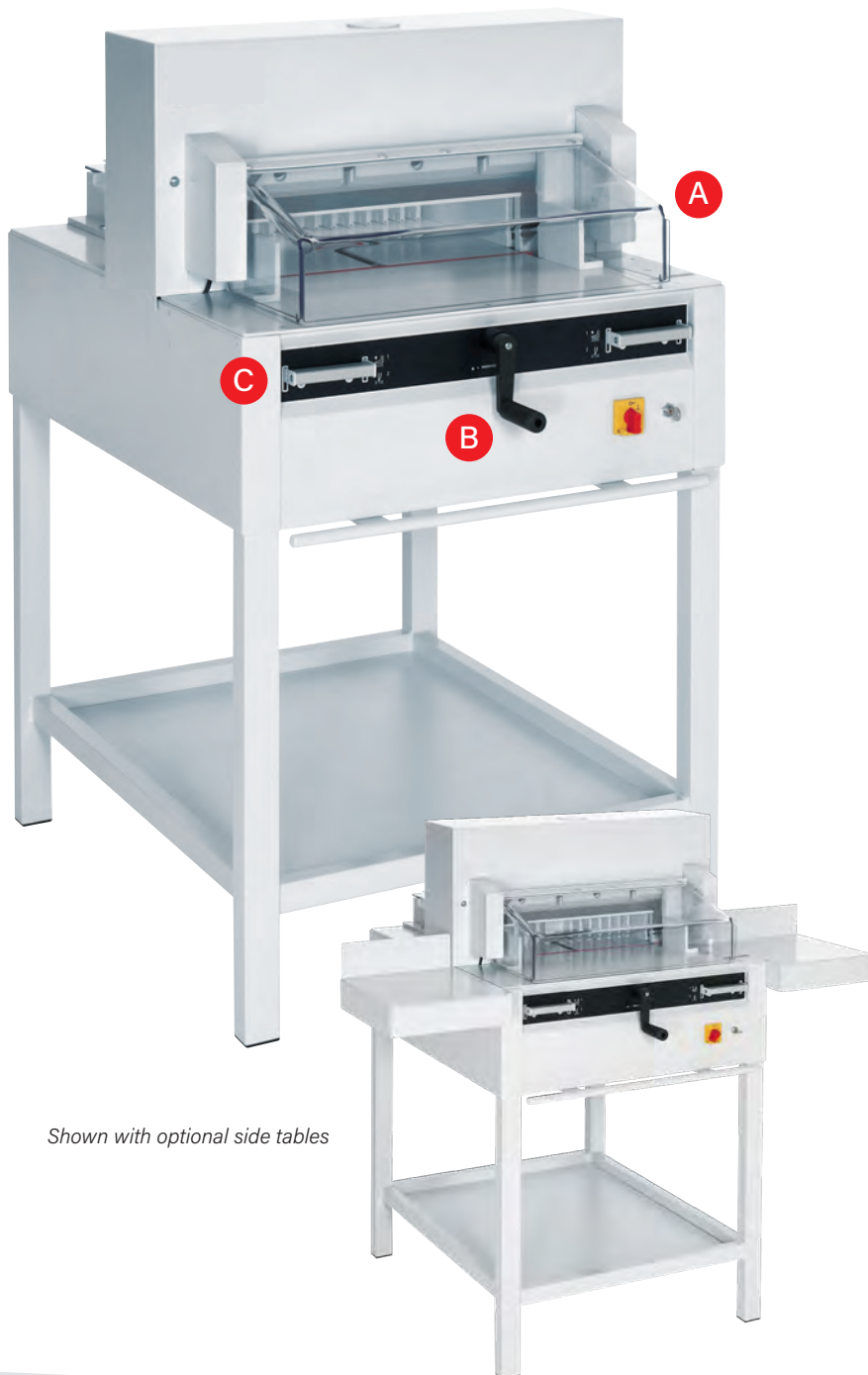
Shown with optional side tables

Fully automatic cutter with electric blade drive, automatic clamp, and EASY CUT blade activation.