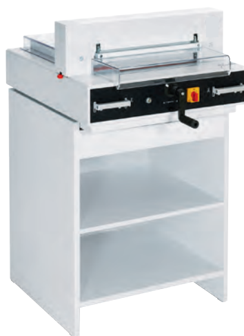
Shown with optional stand and cabinet