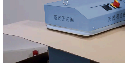
If sheet width exceeds cutting head, excess is trimmed for reuse