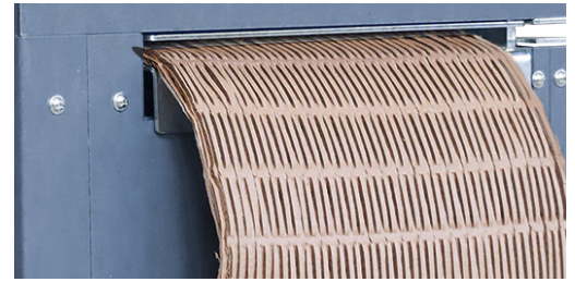
Packing filler exits cutting head in strips up to 425 mm wide

Rugged, durable and built to last, the PacMaster has a proven track record of more than 50 years. It's not uncommon for customers to realize a full return on investment in a year or two. Combine that with a service life that can be measured in decades and maintenance free operation and savings really start adding up.