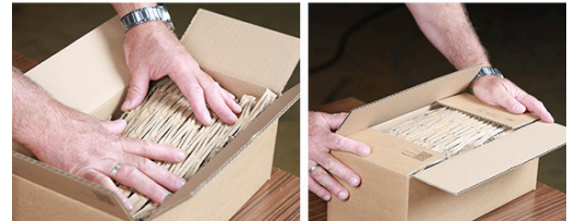
The flexible, netting like filler conforms to any shape item and box