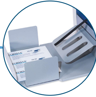
Telescoping Outfeed Outfeed extends to accommodate sheets up to 13.8" x 19"