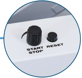
Variable Speed Control Adjustable to process a variety of different paper weights