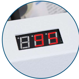
Resettable LED Counter Three-digit counter keeps an accurate tally of processed sheets