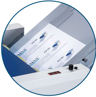
Automatic Feeding Telescoping infeed tray with adjustable side guides and three-tire feed system

The FD 95 Rotary Perforator/Creaser is specially designed to finish printed sheets, up to 13.8" x 19". Its three-tire friction feeding system reliably feeds up to 7,080 sheets per hour , and can create up to 5 parallel perforations and/or creases in a single pass . With variable speed control for different paper weights up to 180gsm, the FD 95 perforates and/or creases automatically, stacking the finished sheets neatly on the telescoping outfeed table . Standard set-up includes two perforating wheels, one creasing wheel and paper guides . Options include additional perforating sets, microperforating sets (17 tpi), creasing sets and guide strips to accommodate 55 - 60gsm paper. It's ideal for small print shops, on-demand, and in-plant finishing applications including postcards, invitations, tear-offs, brochures, billing statements, and more.