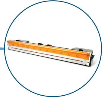
Memjet® Inkjet Print Head Stationary print head for higher speeds, lower ink use, and less noise