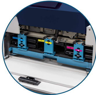
Clamshell Design Offers easy front access to ink tanks and the paper path