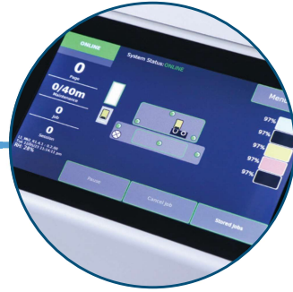
Intuitive 7" Color Touchscreen Displays system status, image preview, and access to 60 GB of stored jobs