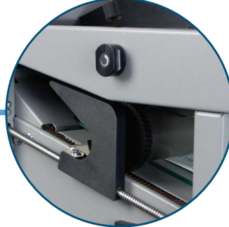
Belt-Driven Outfeed Stacker Outfeed and infeed are located on the same side, for operator convenience