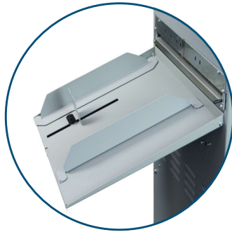
Perforation / Score Attachment Delivers finished pieces to catch tray and can be used as a roller bypass