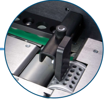
Powerful Air Suction Feed Table Handles coated and non-coated stock, in sizes up to 26.5" long