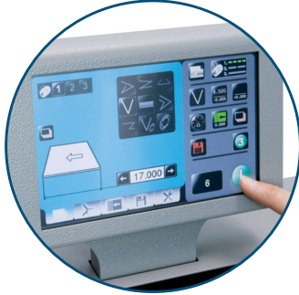
Color Touchscreen Control Panel Graphics-based to allow for quick, easy adjustments and unlimited programming

The ATLAS-AS Air-Feed Document Folder combines high-volume output with user-friendly features in a rugged, compact footprint. It processes up to 27,500 sheets per hour , in various weights and sizes up to 26.5" long. Features include a 7" color touchscreen control panel , unlimited custom jobs , a powerful air suction feed table for coated or non-coated stock, and a low-pressure air chamber which controls curled or statically charged paper prior to folding. The outfeed stacker rollers adjust automatically , and are located on the same side as the infeed, for convenient loading and unloading. A modular perforator/scorer is included, which can be used as a roller bypass, for sheets to be folded and output flat.