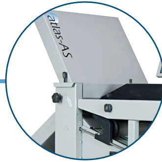
Fully Enclosed Fold Plates Durable fold rollers made of composite material, enclosed for sound reduction