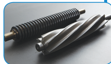
Dual-blade shredding system uses strip cut and spiral blades