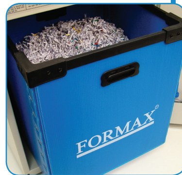
Lifetime Guaranteed Heavy-Duty Waste Bin