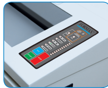
LED control panel with Load Indicator and ECO Mode