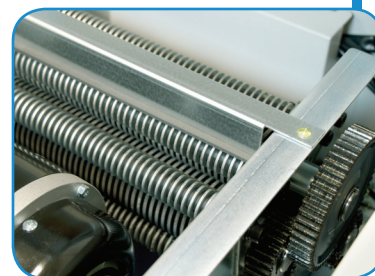
Solid steel gears, heat-treated cutting blades, AC geared motor