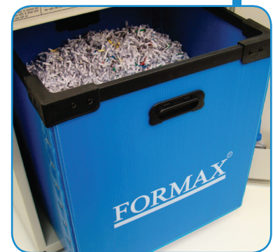
Lifetime Guaranteed Heavy-Duty Waste Bin