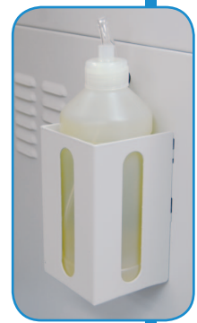
AutoOiler - Automatically pumps oil onto cutting blades