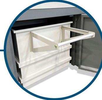
Front Access Waste Bin Shredder can be placed against a wall to maximize space