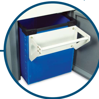
Front Access Waste Bin Shredder can be placed against a wall to maximize space