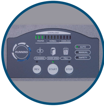
User-Friendly Control Panel Auto and Manual mode, Bin Full Indicator, Load Indicator

The FD 8806CC is a high-capacity conveyor-fed shredder designed to shred entire files, stacks of computer forms, tapes, cardboard, CDs and magnetic discs. Standard features include an LED control panel with load indicator , continuous-duty motor , all-metal gearing , and heat-treated solid steel cutting blades with the power to shred up to 90 sheets in one pass . With front waste bin access , it can be placed against a wall to maximize space, and the rugged molded plastic waste bin on casters is designed for easy emptying. The EvenFlow™ Automatic Oiling System lubricates the all-steel cutting blades, helping to keep the FD 8806CC in peak operating condition.