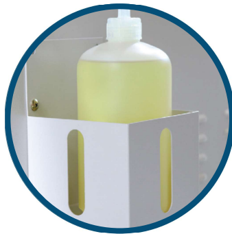
Internal Blade Oiling System EvenFlow™ Automatic Oiling System lubricates blades for peak performance