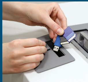
USBs and SD Cards