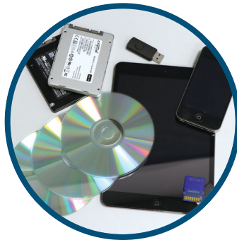
Multimedia Devices: Easily shreds a variety of media from mobile phones to mini tablets