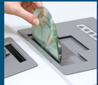
CDs and DVDs