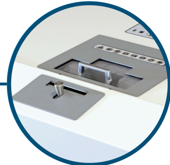
3 Dedicated Infeed Options: Safely feed various size media through the appropriate infeed, up to 6.5" W