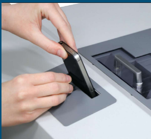
Mobile Phones and SSDs