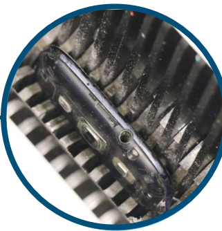
Commercial Grade: Solid-steel heat-treated blades and rugged chain-driven motor