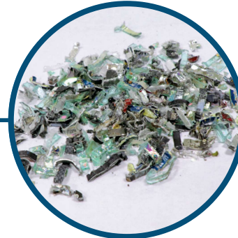
Media Shredding: Shreds media into random pieces up to 0.60". Perfect for security and peace of mind