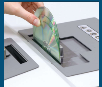
CDs and DVDs