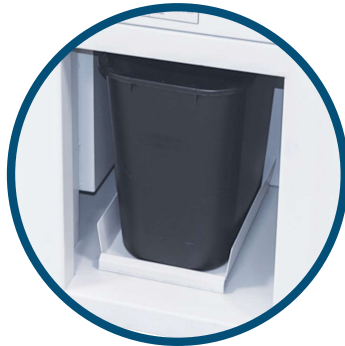
Rugged Waste Bin Durable molded plastic for convenient collection of shredded particles