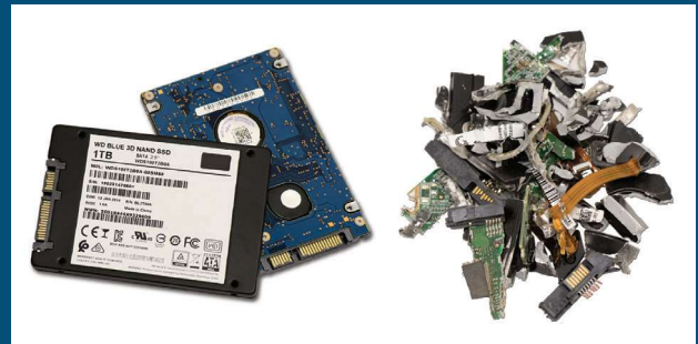
2.5" HDD & SSD Hard Drives