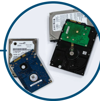
Shreds Multiple Size Drives Designed for shredding 3.5" desktop HDDs, and 2.5" laptop HDDs and SSDs