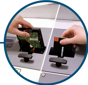
Separate Shredding Chambers Metal safety shields for safe, continuous operation, and individual LED counters