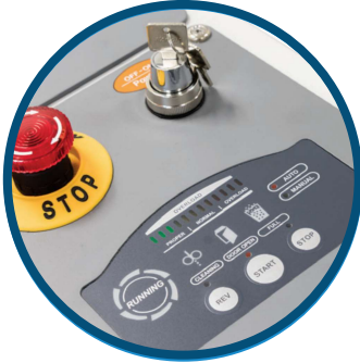
User-Friendly Control Panel Door Open Sensor, Reverse, Waste Bin Full Indicator

The Formax FD 87HDS HDD / SSD Hard Drive Shredder provides the best level of security by physically destroying discarded hard drives. Separate shredding chambers sized for 3.5" HDD and 2.5" SSD & HDD drives have sliding metal shields for safety and are designed for continuous operation . Its chain-driven AC-gear motor is housed in a solid-metal cabinet with casters for mobility and is engineered for low operational noise. Combining safety, durability, and an extra level of security, FD 87HDS is the best choice to protect your digital data.