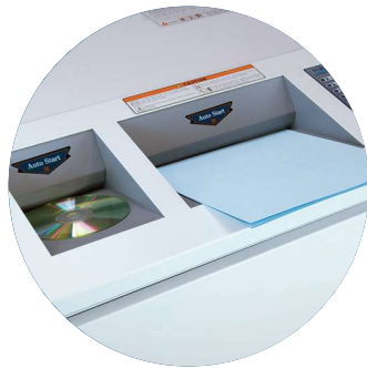
Dedicated Paper & CD Infeeds Separate feed and waste bins for easy disposal of paper and CD's