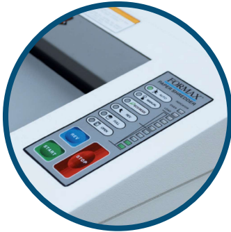
User-friendly Control Panel Auto Start/Stop/Reverse, Full Bin Indicator, Load Indicator

The FD 8730HS High Security Multimedia Shredder meets the requirements of NSA/CSS Specification 02-01 for High Security Cross-Cut Paper Shredders and Specification 04-02 for CD Optical Media Destruction Devices. The Optical Media cutting system shreds up to 2,000 CDs per hour and the Paper cutting system shreds up to 15 sheets at a time . The FD 8730HS includes the EvenFlow™ Automatic Internal Oiling System that lubricates the cutting heads automatically for optimal performance. Standard features include an all-metal cabinet with casters, steel gearing, separate infeeds and lifetime guaranteed waste bins , and a user-friendly control panel with digital load indicator .