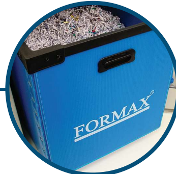
Durable Waste Bin Lifetime guaranteed rugged molded plastic for durability