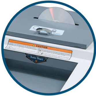
Dedicated Infeeds Two dedicated feed openings for paper, CD's, DVD's, USBs

The FD 8704CC Multimedia Office Shredder combines shredding power with a compact, rugged design. Two dedicated feed openings shred paper and multimedia storage including CDs, DVDs, USB thumb drives, mini-DV tapes and ZIP/floppy disks . Standard features include heat-treated steel blades, a user-friend LED control panel, lifetime guaranteed waste bin , and a powerful AC geared-motor . In addition, the ECO Mode saves energy by automatically switching into standby mode after 5 minutes of inactivity. The optional EvenFlow™ Automatic Oiling System helps to keep the FD 8704CC in peak operating condition.