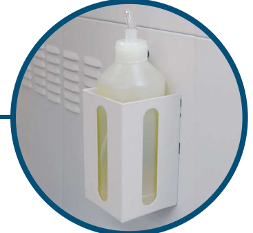
Automatic Oiling System EvenFlow™ Automatic Oiling System lubricates blades for peak performance