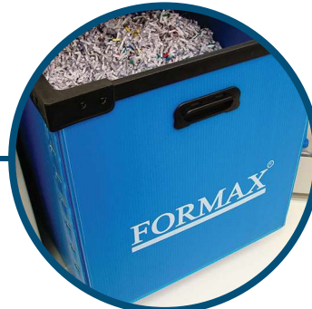
Durable Waste Bin Lifetime guaranteed rugged molded plastic for durability