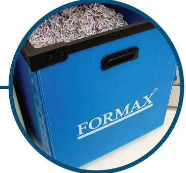
Durable Waste Bin Lifetime guaranteed rugged molded plastic for durability