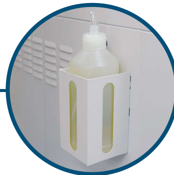
Optional Oiling System EvenFlow™ Automatic Oiling System lubricates blades for peak performance