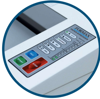
Easy-to-Use Control Panel Auto, Reverse, Bin Full Indicator, Load Indicator, ECO Mode

The FD 8502AF AutoFeed Office Shredder features a dedicated infeed which allows users to load up to 175 sheets, press start and walk away! No more standing in front of the shredder, hand-feeding small stacks of paper one after another. The Hand-Feed Hopper accommodates up to 24 sheets at a time. Commercial-grade features include an easy-to-use LED control panel, heat-treated steel blades, a steel cabinet, lifetime guaranteed waste bin, and a powerful AC geared-motor. In addition, the ECO Mode saves energy by automatically switching into standby mode after 5 minutes of inactivity.