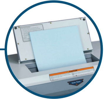
AutoFeed Hopper Infeed Holds up to 175 sheets for convenient, unattended shredding