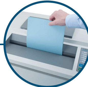
Standard Infeed Hand-feeding slot accommodates up to 24 sheets