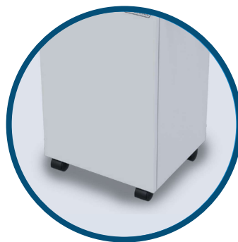
Rugged All-Metal Cabinet Comes with casters for easy moving