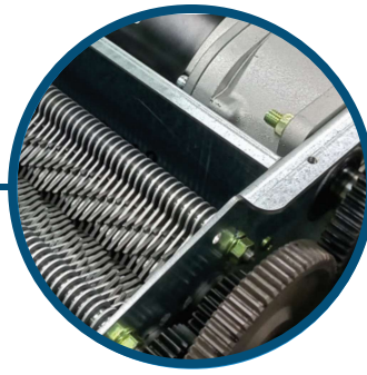
Commercial Grade Heat-treated solid steel cutting blades, all metal gears, AC geared motor