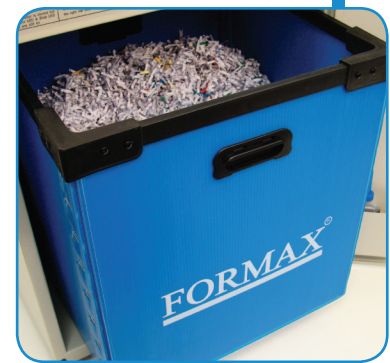
Lifetime Guaranteed Heavy-Duty Waste Bin