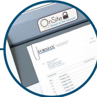
Staples, Paper Clips & Credit Cards Solid steel cutting blades handle staples, paper clips, and credit cards