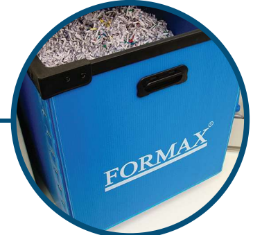
Durable Waste Bin Lifetime guaranteed rugged molded plastic for durability