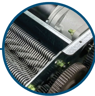
Commercial Grade Heat-treated solid steel cutting blades, all metal gears, & an AC geared motor