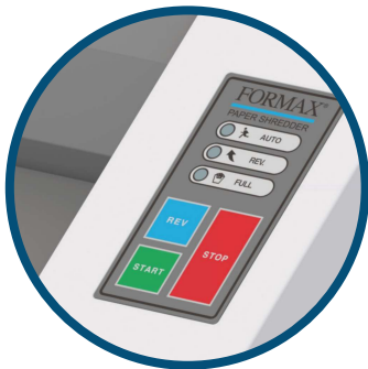
User-Friendly Control Panel Auto Start/Stop/Reverse, Bin Full Indicator

The FD 8304CC Deskside Shredder combines space-saving design with commercial-grade components including an all-metal cabinet , heat-treated steel blades , heavy-duty AC geared motor , and a rugged lifetime guaranteed waste bin . It features a user-friendly LED Control Panel , and has the power to shred up to 26 fpm , as well as staples and paper clips . This compact, rugged model easily provides on-site destruction of sensitive information for small businesses or the home office.