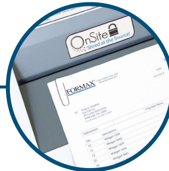
Accepts Staples & Paper Clips Durable steel cutting blades easily handle staples and paper clips