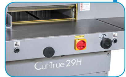
Two-button operation, fine-tune knob, adjustable hydraulic pressure